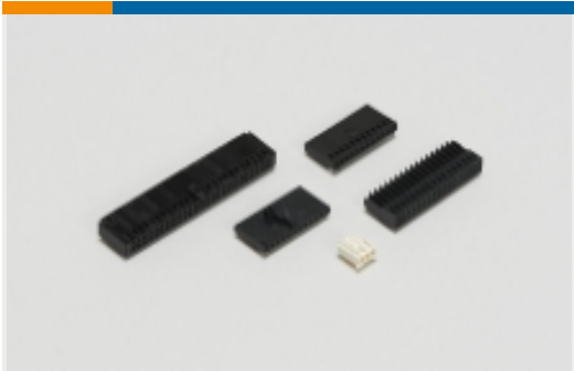
Wire-to-Board Connector Assemblies & Housings(5)