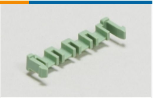
PCB Latches, Locks & Retainers(2)