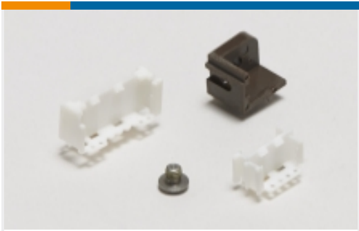
PCB Connector Mounting(1)